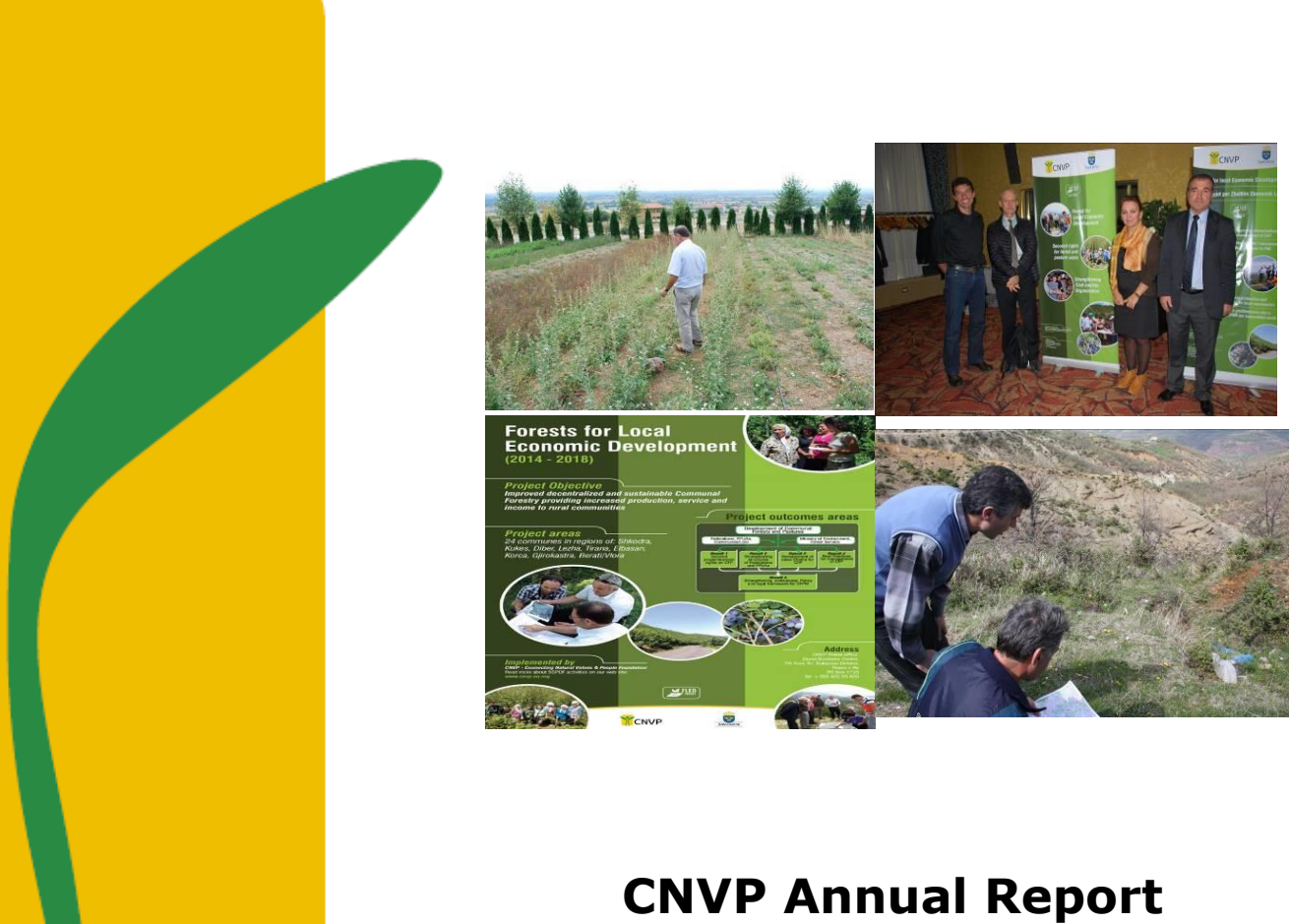
CNVP Annual Report 2014

Connecting Natural Values & People Foundation - Netherlands